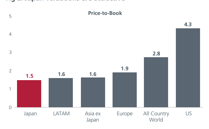
Fig 2: Japan valuations are attractive<sup>2</sup>

We believe the above backdrop offers us a unique advantage to exploit the opportunity using our differentiated value approach. We continue to identify excellent stock buying opportunities in the current environment, taking advantage of market volatility and periods of mispricing to accumulate attractively priced equities in our Japan portfolios.