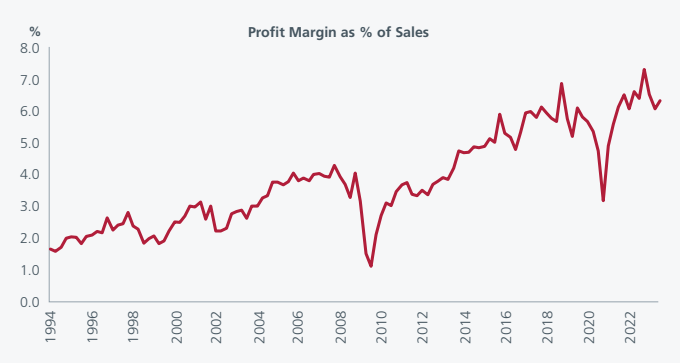
Fig 1: Corporate profitability is on the rise1

1 Japan's companies have been restructuring and deleveraging their balance sheets over the last ten years. The return on assets of non-financial companies has risen, profitability has improved as have cash flows — all of which are giving companies improved profitability and more flexibility in repaying debt, boosting dividends and instigating share buyback schemes.