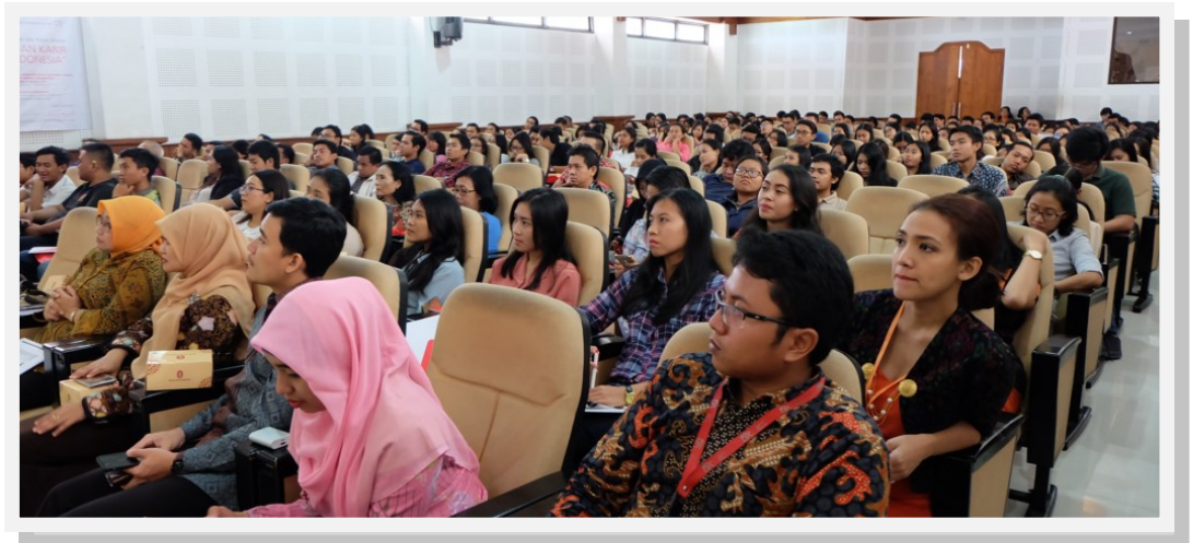
(Right) Attendees were enthusiastic during presentation and Q&A session in Eastspring Tour de Campus 2016 at Faculty of Economy and Business, Udayana University, Denpasar Bali.