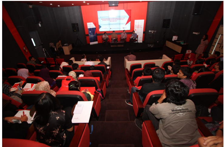
(Above) - Students enthusiastically followed all session in Eastspring Tour de Campus 2014 at Gadjah Mada University Yogyakarta, 21 November 2014.